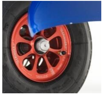
Nose Fork has Dual Shock Absorbing Coil